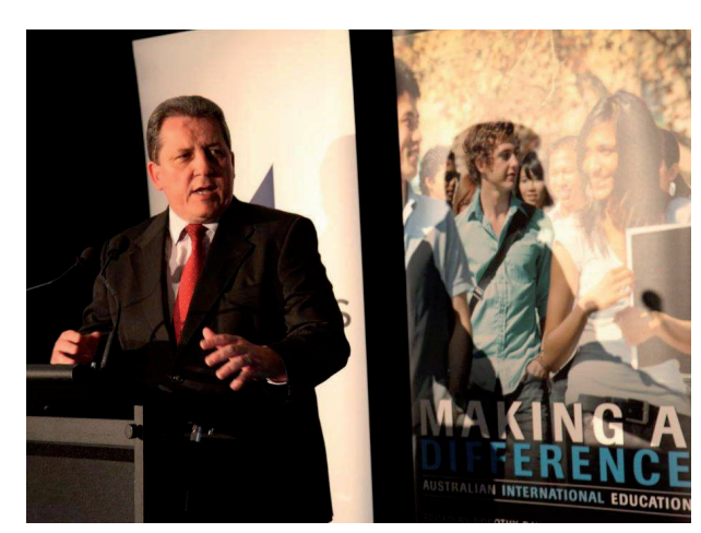
Senator Chris Evans, Minister for Tertiary Education, Skills, Science and Research, speaking at the launch of Making a Difference at Parliament House in Canberra.

In November 2011, IEAA launched Making a Difference – the first comprehensive history of international education in Australia. The launch was held at Parliament House in Canberra, and was attended by the Minister for Tertiary Education, Skills, Science and Research, Senator Chris Evans.